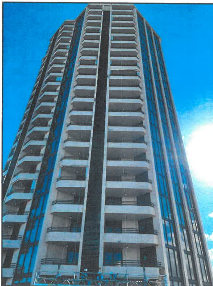
Photograph #1: Completed repairs inspected at the 02/03 balcony stack