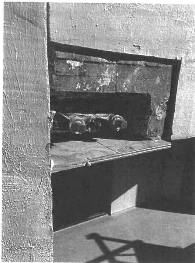
Photograph #2: Completed repair at the 05/06 balcony stack