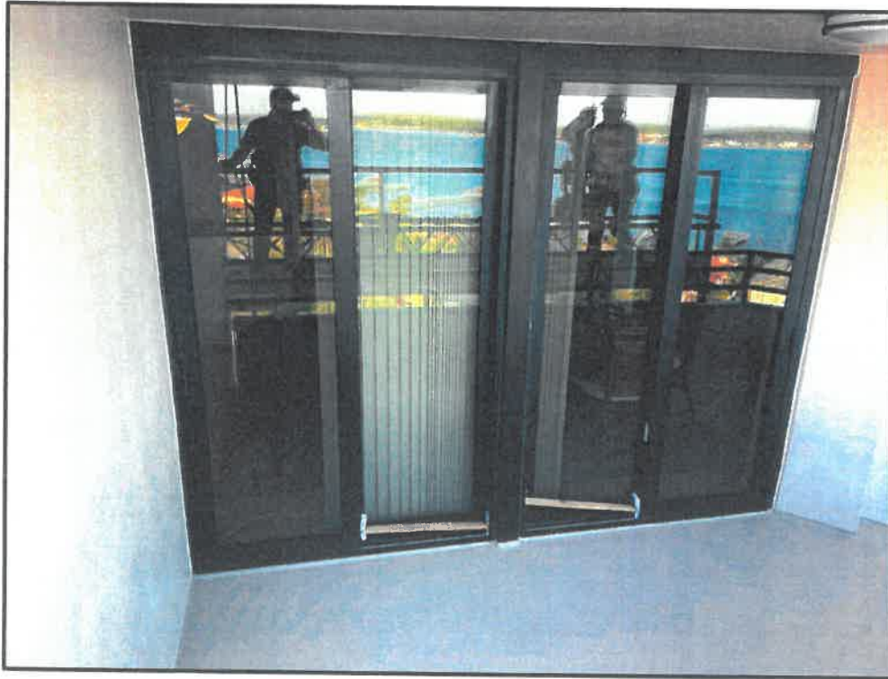
Photograph #3: Construction cleaned windows observed at a balcony on the 01 stack