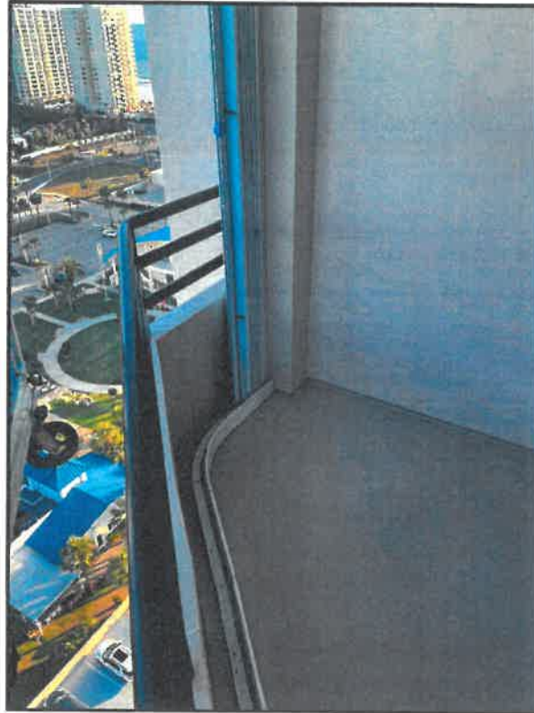
Photograph #1: Excess paint on shutter requested to be cleaned off at Unit 20A2