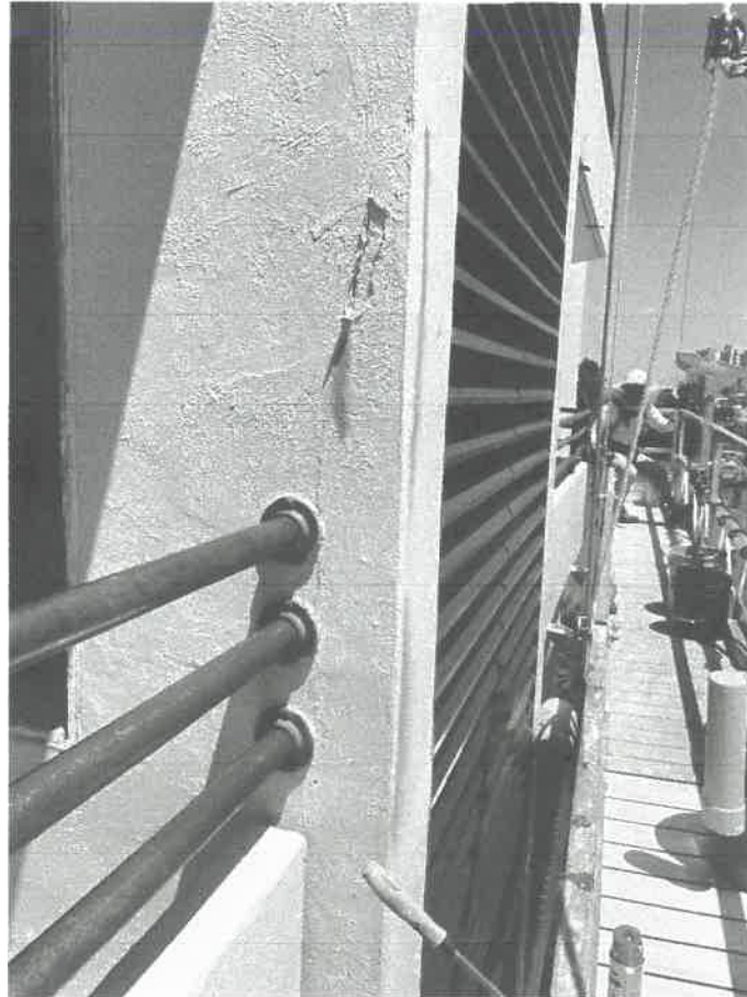
Photograph #1: Larger size wall spall at the 01/02 stack