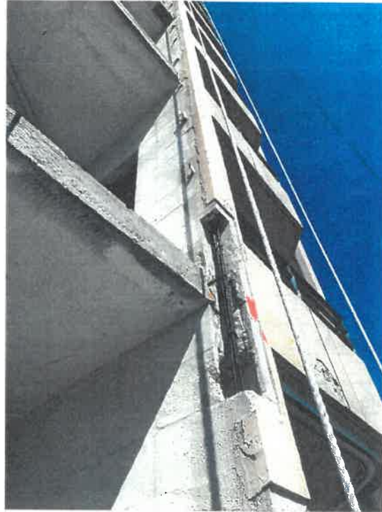
Photograph #1: Typical wall repair inspected at the 03/04 balcony stacks